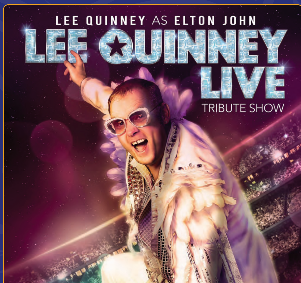
Elton John Tribute February 26th, April 16th June 18th and November 26th