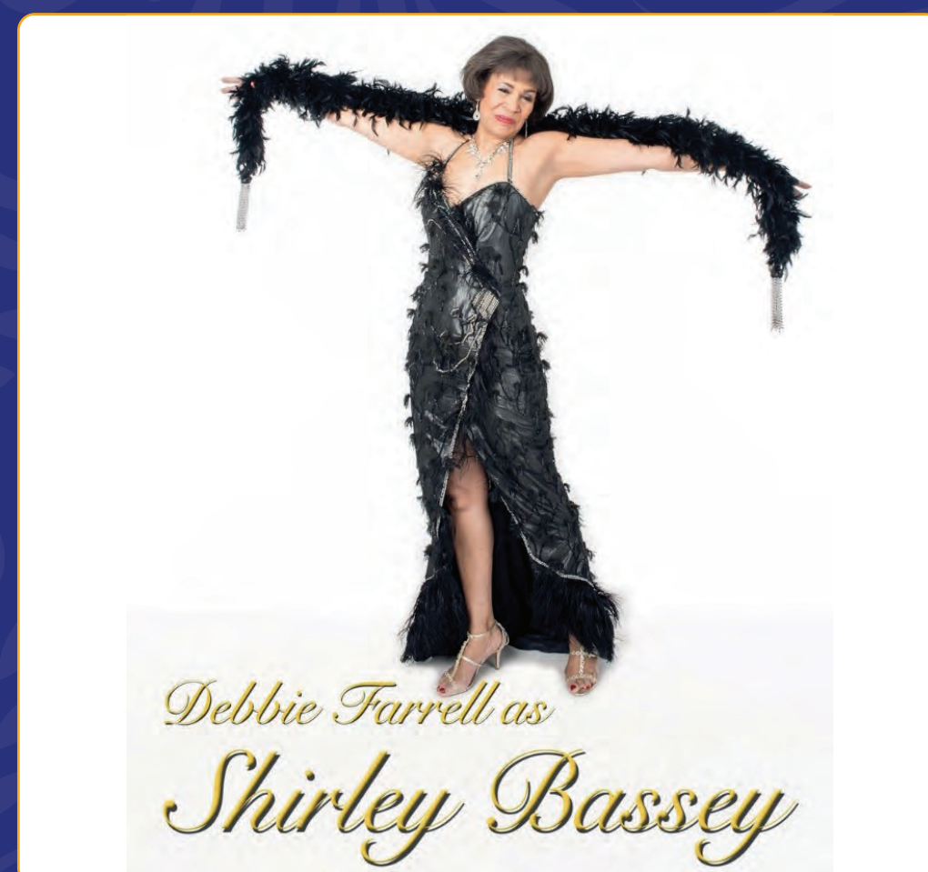
Shirley Bassey March 19th, August 20th and November 5th